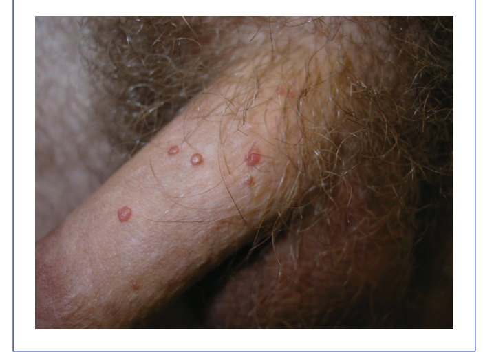
Figure 1. Penile warts manifesting as small, discrete, soft, smooth, flesh-colored, dome-shaped papules.

Penile warts are usually asymptomatic and rarely pruritic or painful.<sup>3,8,13</sup> Penile warts are usually located on the frenulum, glans penis, inner surface of the prepuce, and coronal