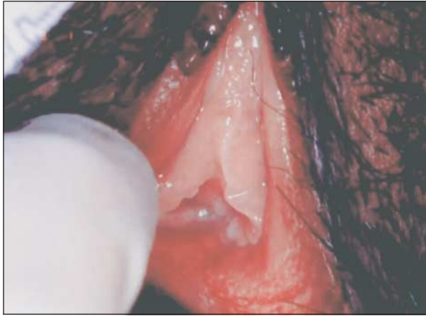
Figure 3. A 19-year-old subject with no history of past sexual intercourse (subject 45). She described the painful insertion of a tampon on 1 occasion. A complete cleft was seen in the hymen at the 6-o'clock position during the examination, but it was not as clearly documented in the photograph, taken at \times 10 magnification.