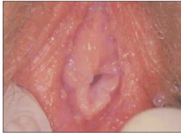
Figure 1. Photograph at \times 10 magnification, showing a 19-year-old subject who admits to having consensual intercourse. Any notches or clefts in the hymen are unable to be clearly seen in this view.

Because the examiner was able to manipulate the hymenal tissue during the examination and make nota-