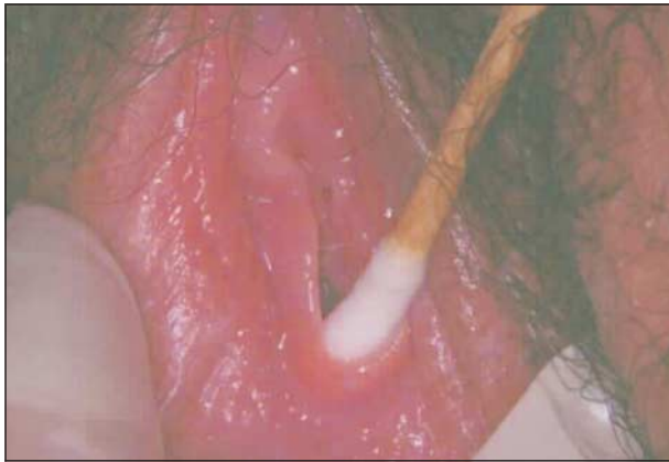
Figure 4. A 16-year-old sexually active subject who admits to consensual sexual intercourse. No notches or clefts were visible in the hymen during examination. The subject was able to relax and allow stretching of the hymenal rim with a cotton swab. The photograph was taken at \times 10 magnification.

more. Table 2 presents a comparison of the number of subjects with 0 to 1 and 2 to 4 notches or clefts in the posterior or lateral locations and between subjects with and without a history of sexual intercourse, using the Fisher exact test.